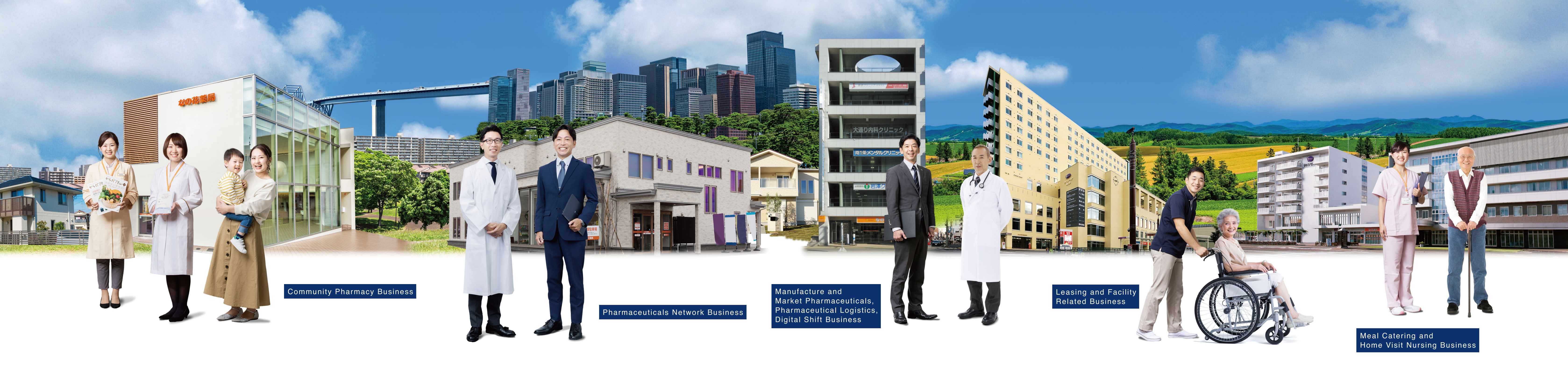
Community Pharmacy Business